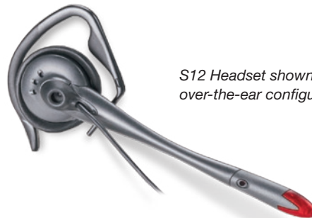
S12 Headset shown in over-the-ear configuration