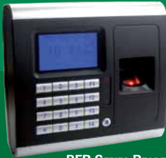
BFR SERIES READER

Innovative system integrated fingerprint readers by RBH are available with Multi-prox or MIFARE proximity readers. Users will benefit from its unparalleled performance, ease-of-use, precision and fast matching speed.