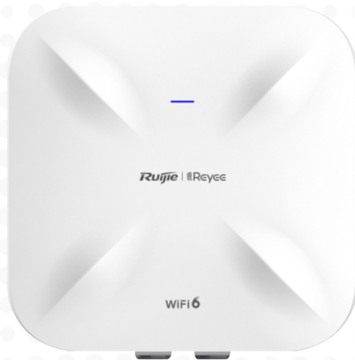
Figure 1-1 RG-RAP6260(G)