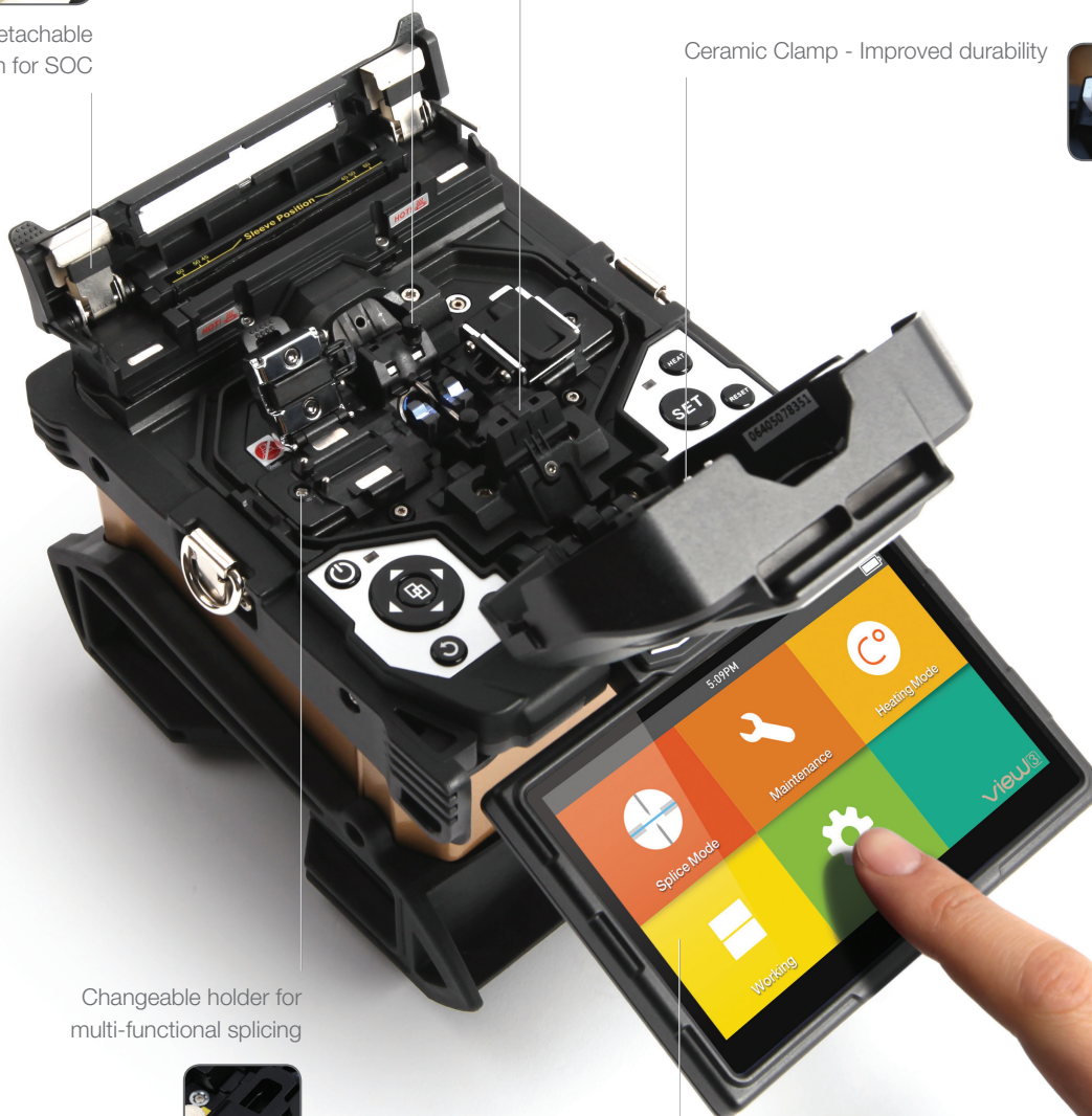
Changeable holder for multi-functional splicing